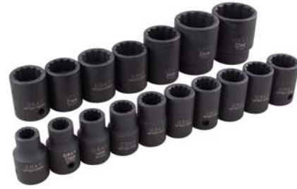
39117 17 Piece 1/2" Dr. Metric Impact Socket Set