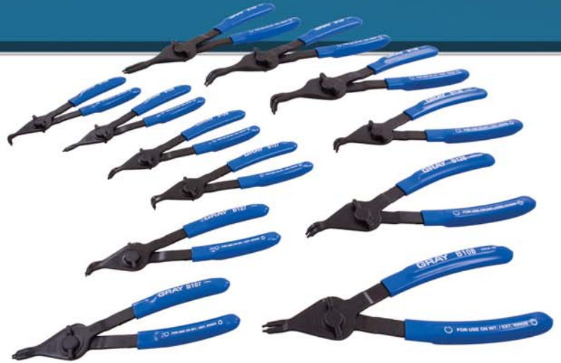
B111 12 Piece Convertible Snap Ring Plier Set List $383.68 $234 95