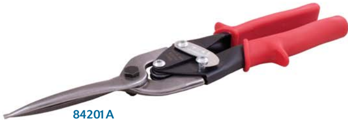
84201A Long Nose Aviation Snip with Vinyl Grips • 11 1/2" long List $43.24 $27 95