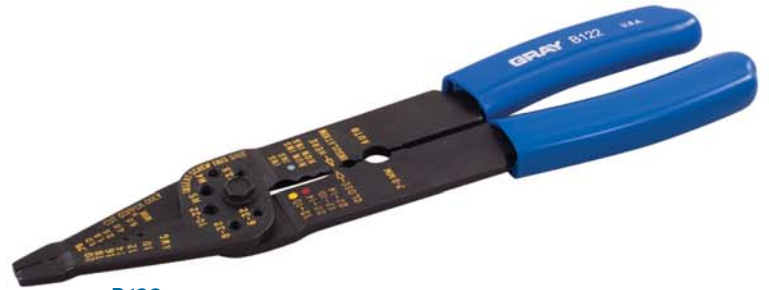
B122 Stripper, Crimper & Bolt Cutter • 9 1/2" long List $48.86 $31 95