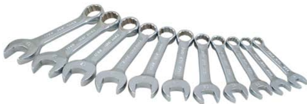
64811 11 Piece Metric Stubby Combination Wrench Set