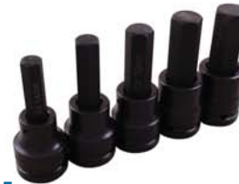
46805 5 Piece 3/4" Dr. Metric Impact Bits Socket Set