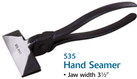
535 Hand Seamer • Jaw width 3 1/2" • Throat depth 1" List $68.34 $39 95