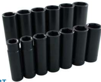
PL13T 13 Piece 1/2" Dr. SAE Deep Impact Socket Set