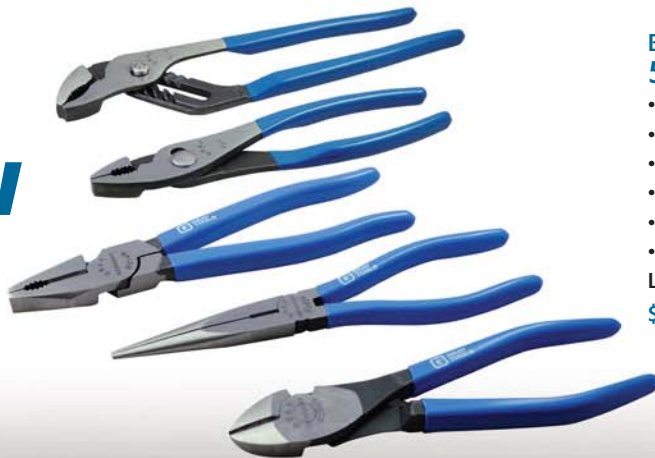
B5PLS 5 Pieces Pliers Set • 8" Lineman's Plier • 8" Needle Nose Plier with Cutter • 7 1/4" Diagonal Side Cut Plier • 10 1/8" Adjustable Joint Plier • 8" Slip Joint Plier • Includes foam tray organizer List $181.96 $116 95