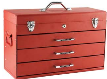
97103A 3 Drawer Hand Box