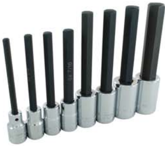
DW24XLS 8 Piece 1/2" Dr. SAE Hex Head Socket Set